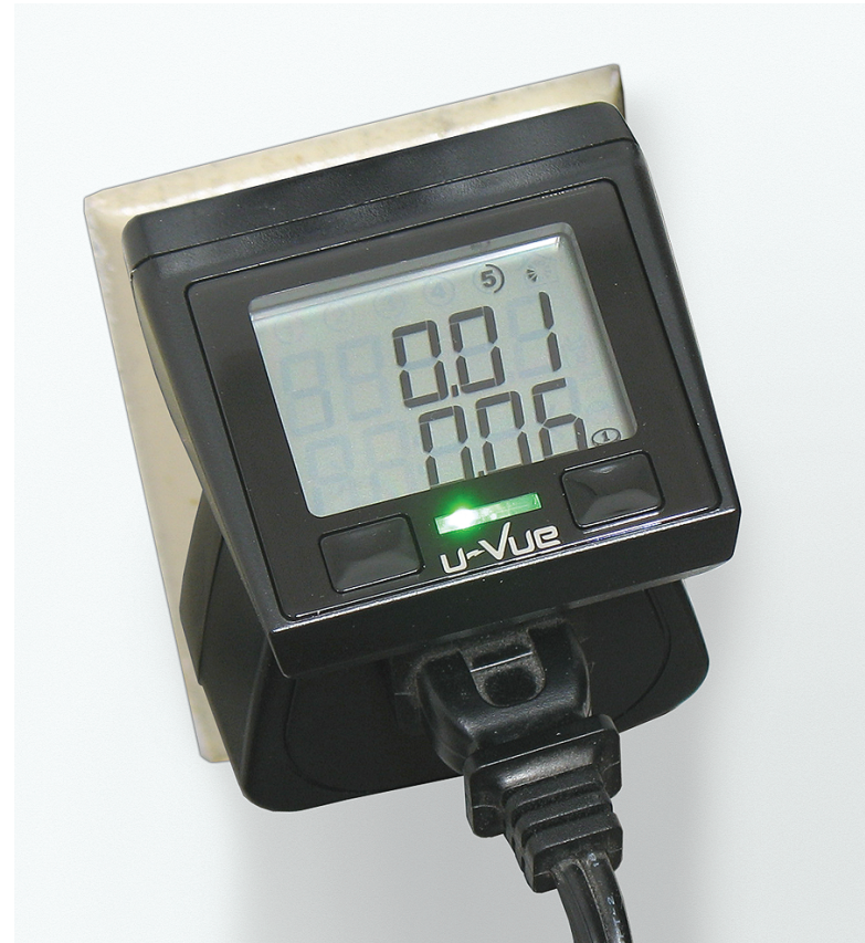
Floor Fan Electrical Cost of $0.01/Hour with an Electricity kWhr Usage 0.06 (Mode 5)